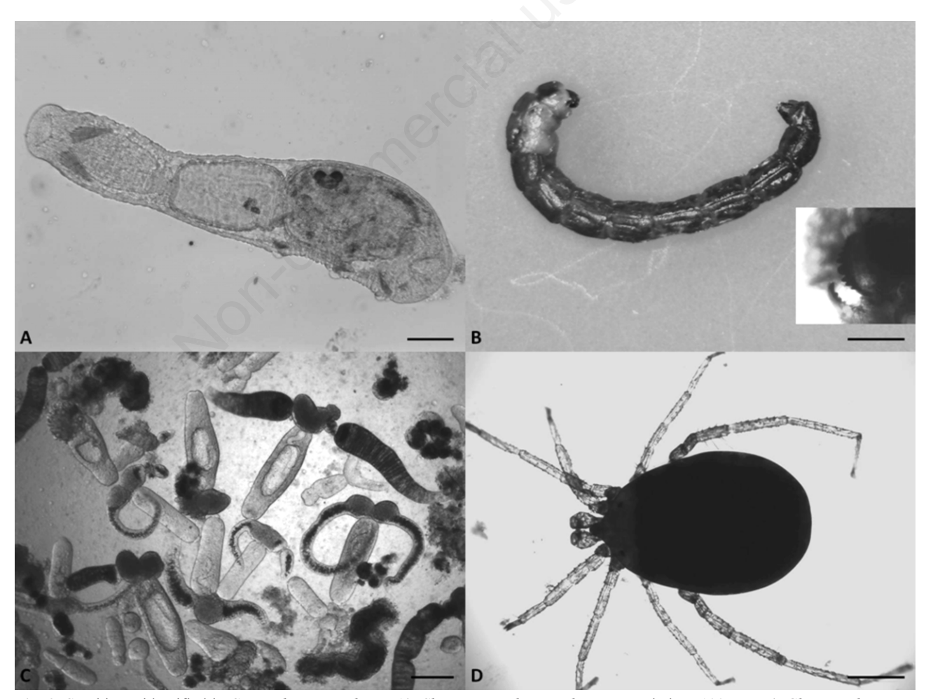
Fig. 2. Symbionts identified in Sinanodonta woodiana . A) Chaetogaster limnaei limnaei ; scale bar: 100 μm. B) Glyptotendipes sp.; scale bar: 200 μm. C) Rhipidocotyle campanula ; scale bar: 150 μm. D) Unionicola ypsilophora ; scale bar: 300 μm.

search, R. campanula was found in S. woodiana only in thermally polluted lakes. The ability to create new relationships in heated lakes may result from both i) the higher temperature of water, which facilitates the recruitment of parasites and promotes their transmission to hosts (Poulin, 2006); and ii) the more diversified spectrum of the second and final fish hosts of R. campanula, including Rutilis rutilus, Perca fluviatilis and probably Stizostedion lucioperca (Gibson et al., 1992), in comparison to fish ponds. In native bivalve species, e.g. A. anatina, the presence of bucephalid trematodes decreases the production of glochidia (Taskinien and Valtonen 1995), causes partial or complete castration (Jokela et al., 2005; Gangloff et al., 2008; Müller et al., 2015), increases mortality (Taskinen et al., 1997) and causes changes in shell shape (Zieritz and Aldridge, 2011). The ecological consequences of the infestation of Chinese pond mussels by R. campanula remain unknown and further studies should address the question of whether this parasite significantly burdens