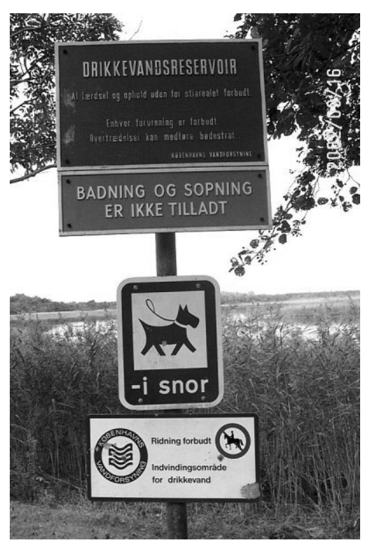
Fig. 2. The signs shown are at the shoreline of a Danish lake that is used as water resource for production of drinking water. The signs have the following text. This is a drinking water reservoir. All contamination of the water is strictly prohibited. Fines will be given by violation. Swimming and all kind of bathing in the water is not allowed. Riding is prohibited. Dogs must be kept in strings.

Figure 2 illustrates the importance of the protection of the water sources. The shown sign is at the shoreline of a Danish lake applied for water supply. Denmark is fortunate to have sufficient of good quality ground water. It is only in the Copenhagen area necessary to use surface water which is very protected against contamination. The lake was included in the lake school project and convinced the school children of the importance of the drinking water quality.