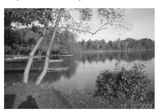
Fig. 1 . Lakes have often clear borderline to other types of ecosystems as for instance on the figure, where the borderline between the forest surrounding the lake and the lake is easily found.

processes characteristic for the functioning of the lake make up a network where the nots are various organisms with characteristic properties. A food net can easily be found in a lake: nutrients -phytoplankton – zooplankton – small fish – big carnivorouse fish. Moreover, the cycling of the important elements nitrogen, carbon, phosphorus and so on is easily perceived: the transfer through the food chain produces detritus which is mineralized and the nutrients are recovered. The lake is instantly conceived as an entity.