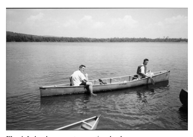
Fig. 4. Lakes have great recreational values.

lems on the other side. The seven problems are eutrophication, water level decrease, acidification, siltation, salinization, contamination by toxic substances and introduction of exotic species. The human activities cause overexploitation of water resources, over use of land and increased emission to the environment due to the increased activities – and these three consequences of human activities lead furthermore to the seven pollution problems presented above. The seven pollution problems reduce our possibilities to utilize lakes as water resource, for navigation, for fishery and for recreational activities.