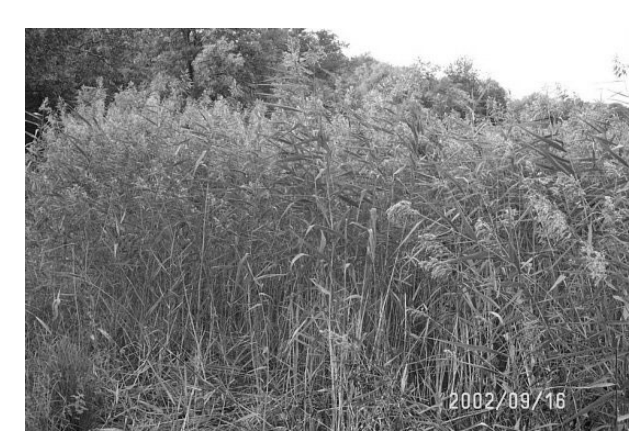
Fig. 3 . A reed-swamp between a lake and its surrounding environment form a transition system between two ecosystems, named an ecotone.

most importance for the health of the lake and that a buffer zone (often a wetland) between land and the lake reduce the vulnerability of the lake to the shore activities. Figure 3 illustrates a typical ecotone as the transition system between two different ecosystems is named. The protection of the lake by a shore ecotone can be compared with the membranes for the cells and the skin for human being.