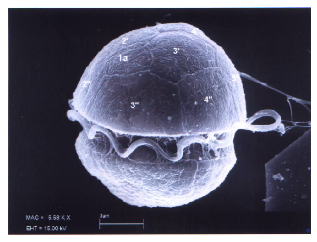
Fig. 1. Dorsal view of Pfiesteria shumwaye.

The objectives of this study are to: 1) Examine the plate tabulation of a Pfiesteria -like organism (cell culture CCMP 1838) with unknown plate tabulation to determine if it is a Pfiesteria species, and 2) Make comparisons of the plate tabulations and features of CCMP 1838 to: a.) Cells of another dinoflagellate culture CCMP 1833 (a member of this PLO "Lucy" group), and b) cells of Pfiesteria shumwayae (a toxic dinoflagellate).